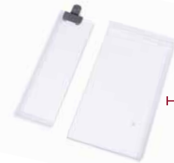
2+2 CONFIGURATION KIT