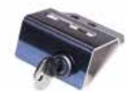
DOOR HANDLE WITH LOCK