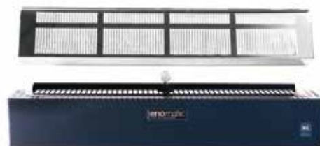
TWO-COLOUR BOTTOM DRAWER KIT